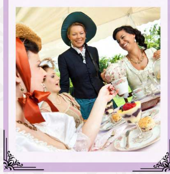
Victorian Garden Party Featuring tea service, live music, activity stations, photo opportunities, and more.

Sunday, July 14th 12:00pm to 3:00pm In-Person (Rain Date Selected)