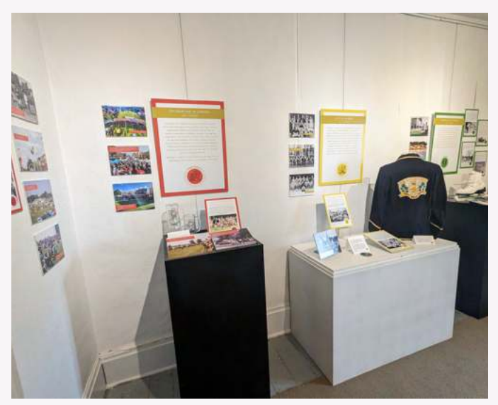
Aurora Through the Archives: Growing Up Aurora

Do you remember the Aurora Horse Show at Town Park, or maybe when it was in Machell Park? What about the Aurora Public Library when it was on Victoria Street, or swimming in the George Street Pool? If you are looking for a trip down memory lane or you are interested in seeing what it was like as a child in Aurora over the last 100 years, visit our new exhibition Aurora Through the Archives: Growing Up Aurora and Through the Hillary Lens , on display at Hillary House National Historic Site from May 6th to June 29th.