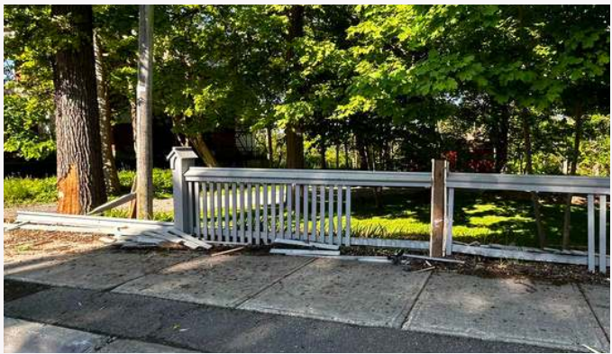
Damage to our heritage fence occurred afterhours on Thursday, May 23rd, 2024.

If you have been past Hillary House in the last couple of weeks, you will have noticed that three sections of the fence closest to the driveway are damaged. On the night of May 23rd, an incident resulted in a vehicle hitting the fence.