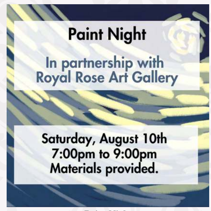
Paint Night In partnership with Royal Rose Art Gallery & Gifts Saturday, August 10th at 7:00pm, In-Person