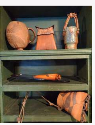
Some highlight items for sale in our Gift Shop, but the shelves have space for more!

Looking for something new? Items continue to come in regularly, so you never know what you might find! Items currently available include local honey, Aurora maps, crystal and many other unique pieces. Need a summer read? Purchase a book about the local history of Aurora or a novel, all available in our Gift Shop.